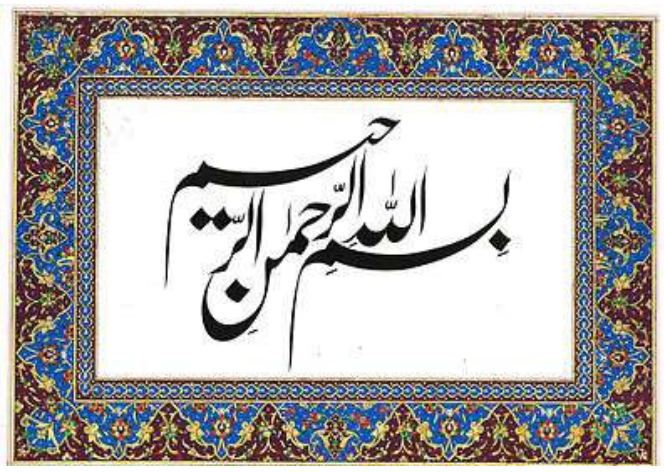
Salvation and the Afterlife

The Koran rejects the notion of redemption; salvation depends on a person's actions and attitudes. However, tauba ("repentance") can quickly turn an evil man toward the virtue that will save him. Islam does not hold out the possibility of salvation through the work of God, but invites man to accept God's guidance.